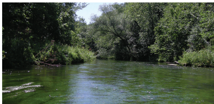
Beautiful View of the Kinnickinnic River