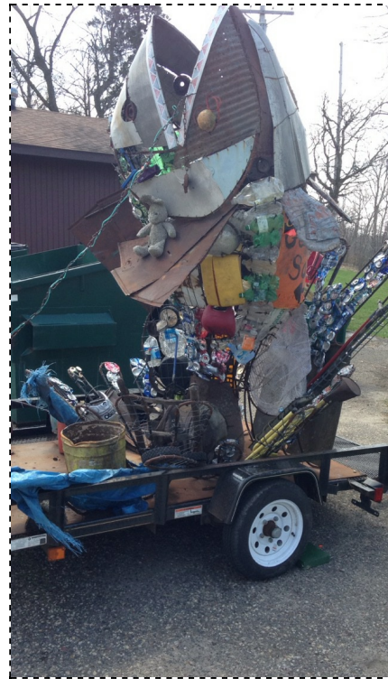
Scrappy All dressed up with places to go

Scrappy will be back in River Falls as the KRLT float in the River Falls Days Parade on Friday, July 10. Please join us on Saturday, July 11 as we "undress" Scrappy as part of our KRLT River Falls Days event.