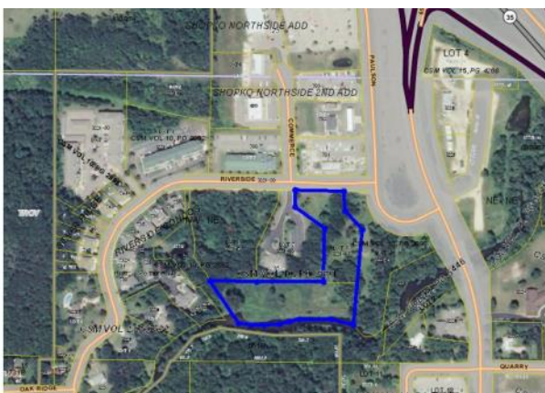
Above: Property location map of our first urban land protection project on 4+ acres in the City of River Falls!

The Kinnickinnic River Land Trust Board of Directors and staff would like to thank all of our committed volunteers and partners for sharing their time, talents and services throughout the year!